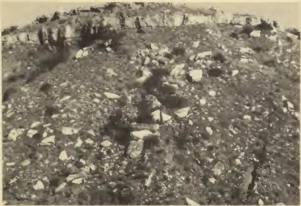
FIG. 7.—Rocky slope south of Stinnett, Hutchinson County.